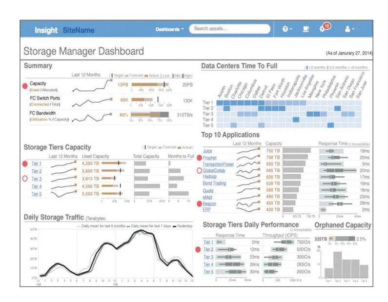
Figure 1) This out-of-the box dashboard is designed for storage managers and business analysts to use for application capacity planning and identifying cost-saving

information is collected for full visibility of your entire storage environment. You can quickly identify misused, misaligned, underused, or orphaned assets and reclaim them to fuel future expansion. When integrated into your daily operations, OnCommand Insight reduces service-delivery time and yields significant operational improvements. Your administrators focus less time on reactive troubleshooting and routine tasks and more time on business-critical projects.